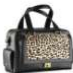
The Style List: Seasonal adjustments