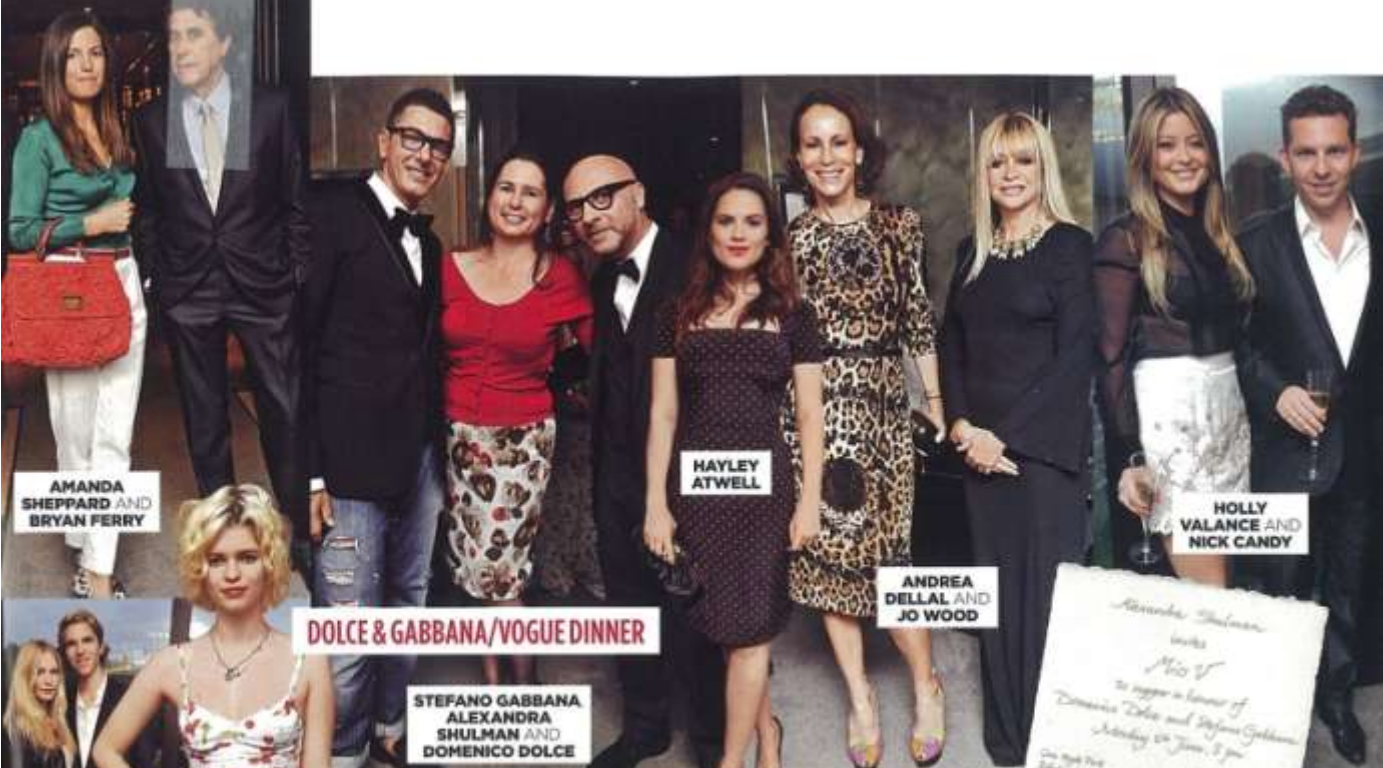
DOLCE & GABBANA/VOGUE DINNER