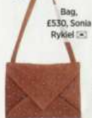
Bag, £530, Sonia Rykiel [X]