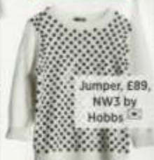
Jumper, £89, NW3 by Hobbs [X]