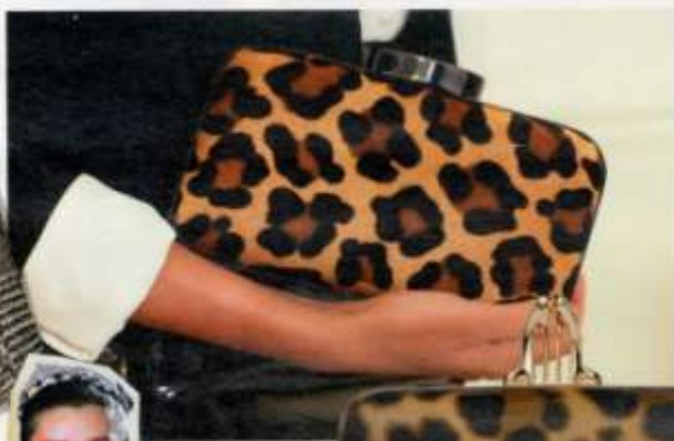
£695, Christian Louboutin

I love how designers have reinvented the bomber in luxe materials such as silks and faux-furs. Here are three of my favourites, which can be worn to dress up jeans, or for a glam night out with a pencil skirt or dress.