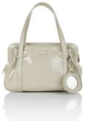
A handbag from the Lulu Guinness for HSN collection