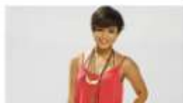
Photo Booth at the Nike U.S. Open of Surfing