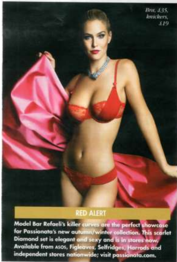
Bra, £35. knickers, £19