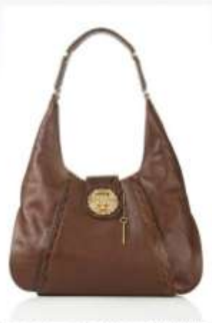
A handbag from the Fiona Kotur for HSN collection

Described by the designer as "classic, all-American, New York jet-set, artist-chic" silhouettes, offerings range in price from $199-99 to $229-90.