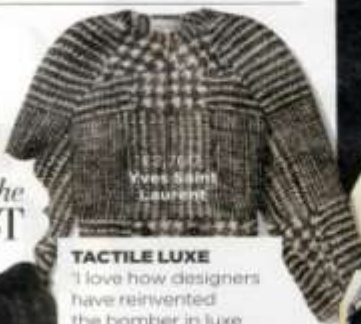
£270, Yves Saint Laurent