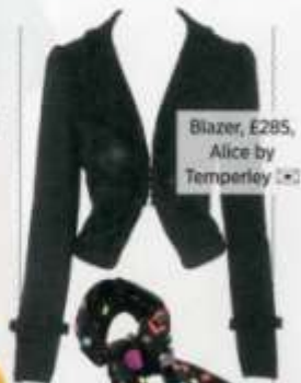
Blazer, £285, Alice by Temperley [X]

Top, £130; trousers, £130, both Boutique by Jaeger [X]. Shoes, £485, Jimmy Choo [X]. Clutch, £450, Lulu Guinness [X]