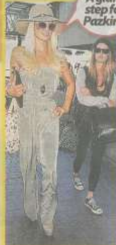
Agiant step for Pazkind