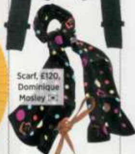
Scarf, £120, Dominique Mosley [X]