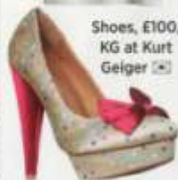
Shoes, £100, KG at Kurt Geiger [X]